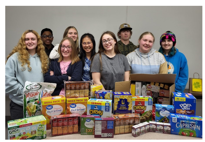
During April, the Jr. Leaders collected donations for the Richland School District "Snack Packs for Backpacks" program.

Do you like summer camp? Apply to be a 4-H Camp Counselor! May 6th is camp counselor training. Summer camp dates are June 11-13.