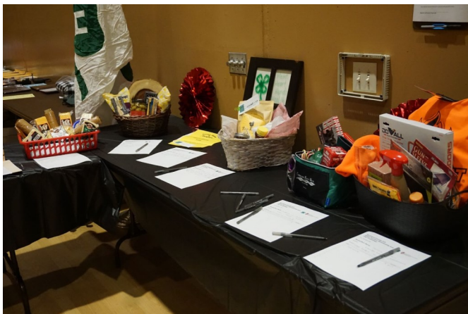
Proceeds from the Silent Auction held at the 4-H banquet will fund 4-H Scholarships

More photos from the 4-H Recognition Banquet.