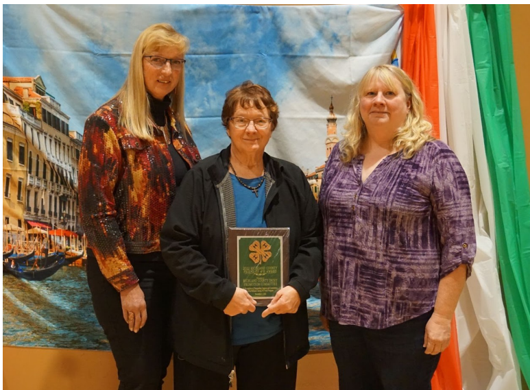
Friend of 4-H Award was presented to the Richland County Dairy Promotion Committee for their support of 4-H.