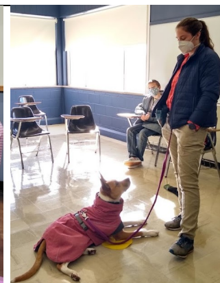
4-H Discovery Day—February 19, 2022