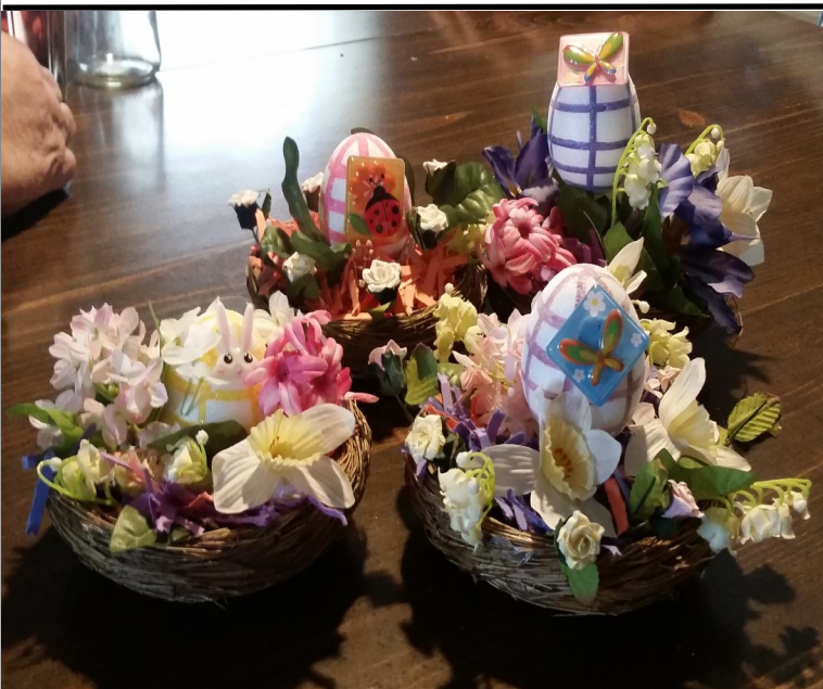
Pictured above: HCE County Liners made Easter nests for themselves as an activity.