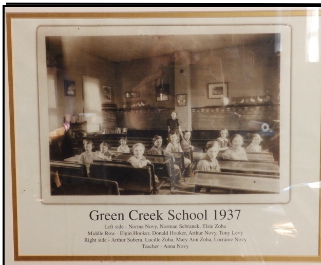
Green Creek School 1937