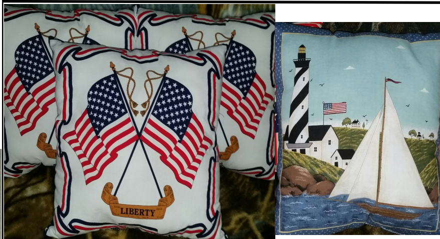
The Packer blanket, the Liberty pillows, and Lighthouse pillow were made and donated to St. John's School for their fundraiser.