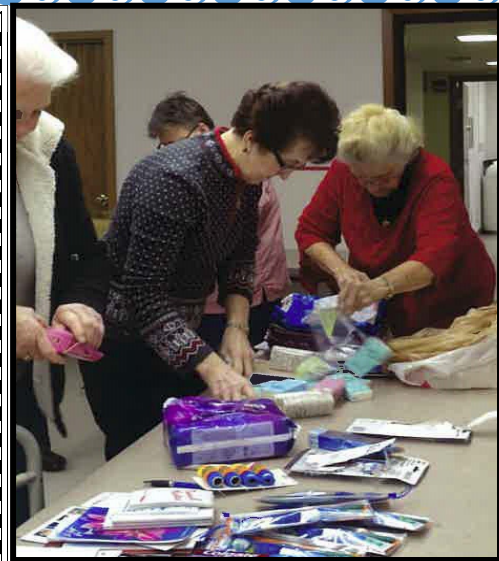
Above are members of the Executive Board putting personal bags together for the residents of Passages.